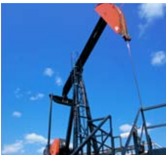
We explore for, develop and produce oil and natural gas across western Canada.

At CPC, we conduct our business with a focus on safety, the environment and stakeholder relationships. We develop our projects in a way that is intended to enhance the economic and social benefit to communities while minimizing the environmental impact associated with development.