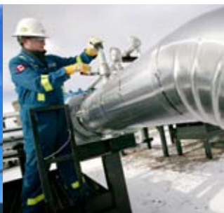
Near Fort McMurray in Alberta, we extract bitumen from oil sands at both operated and non-operated projects.