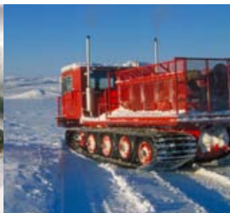
We have a strong position in the Arctic with future potential gas developments.