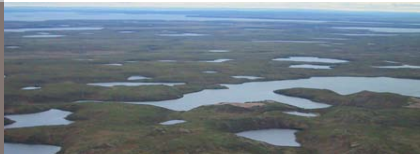
Photo above: Elder consultations for environmental studies near Parsons Lake.

Through this combination of science, traditional knowledge and consultation, ConocoPhillips Canada is working to minimize the impact on the environment while respecting traditional land use.