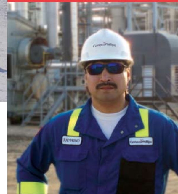
Photo right: Northern apprentices are working at ConocoPhillips operations in Alberta as part of the POTC program.